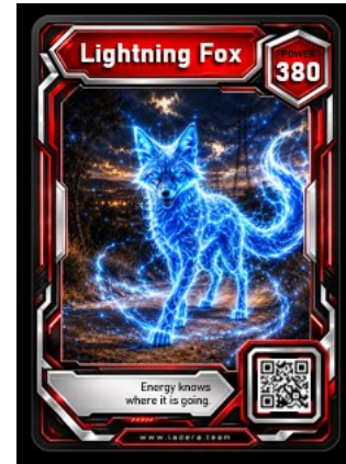
Sample collectible cards: Ghost Captain • Thread Dragon • Lightning Fox